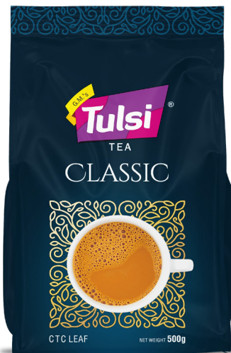
Tulsi Classic CTC Leaf

Classic, but with a GujarateA twist! Broken, Fannings, and Kitley – it's the tea trio that takes you on a timeless joyride. Picture yourself on a chai-chariot, racing through the vibrant streets of Gujarat with each sip.