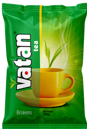
Vatan Brokens CTC Leaf

Vatan range curated for those who carry the pride of being a GujarateA everywhere they go! Our Brokens and Fannings are like a warm tight hug from the homeland. Close your eyes, take a sip, and let the flavours transport you to place called 'Home.'