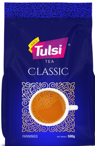
Tulsi Classic Fannings CTC Fanning