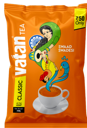
Classic Vatan CTC Leaf

Our Vatan Tea Classic range echoes the ecstasy of Garba, infusing each sip with the vibrant joy of Gujarat. With patriotic pride, every swirl becomes a flavorful homage to our roots, a celebration of heritage in every cup.