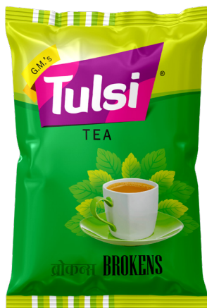
Tulsi Brokens CTC Leaf

Unveil the essence of Gujarat with our Tulsi Tea Range - from the bold and robust Brokens to the finely balanced Fannings and the full-bodied Kitley, each sip is a journey through the rich taste of GujarateA traditions.