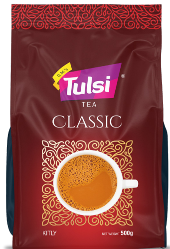
Tulsi Classic Kitley CTC Dust