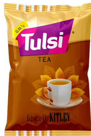
Tulsi Kitley CTC Dust