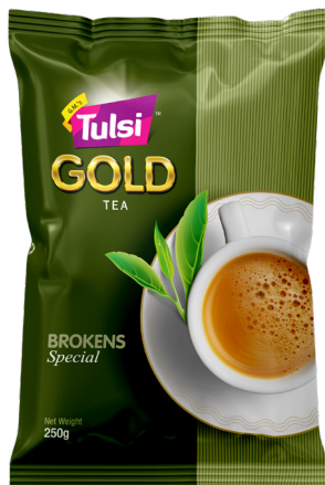
Tulsi Gold Broken CTC Leaf

Experience the richness of Tulsi Gold – where our Broken and Fannings give every cup a touch of GujarateA culture. Sip and savour the subtle notes that turn your everyday tea into a moment of quiet indulgence.