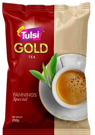
Tulsi Gold Fannings CTC Fanning